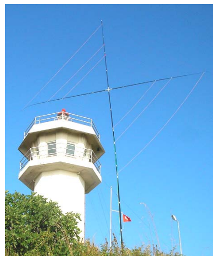
1el Quad 20/15/10 on 12m fiberglass pole

The metal center joint has very small packaging dimensions, as it can be disassembled completely. The kit is well suited for building a 1el Quad for 20m and all bands above.